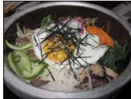
Dolsot Bibimbop in hot stone bowl at Hon Sushi