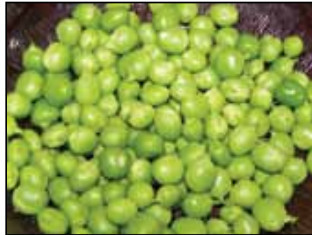
Can't get any fresher than these peas from Pennington Farmer's Market

The Bent Spoon , 35 Palmer Sq. West, Princeton, 609-924-2368, thebentspoon.net