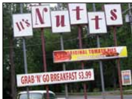
It's Nutts in Titusville

Ice Cream/Gelato: Princeton's Bent Spoon has taken the concept of fresh, original ingredients to new heights. They aren't the only shop making their own ice cream, but their flavor combinations make them the most adventurous.