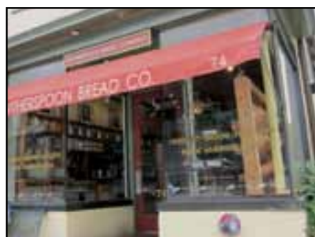
Artisan bread bakers Witherspoon Bread Company, in Princeton